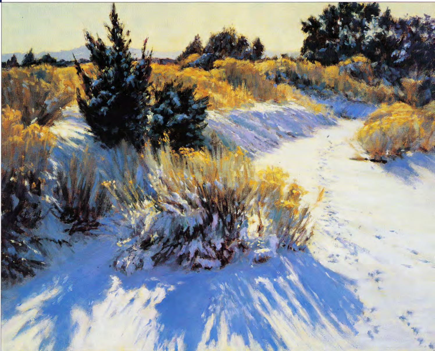
ABOVE: TRACKS IN THE ARROYO, OIL, 24 X 30. OPPOSITE PAGE: SANTO DOMINGO COUNTRY, OIL, 24 X 30.