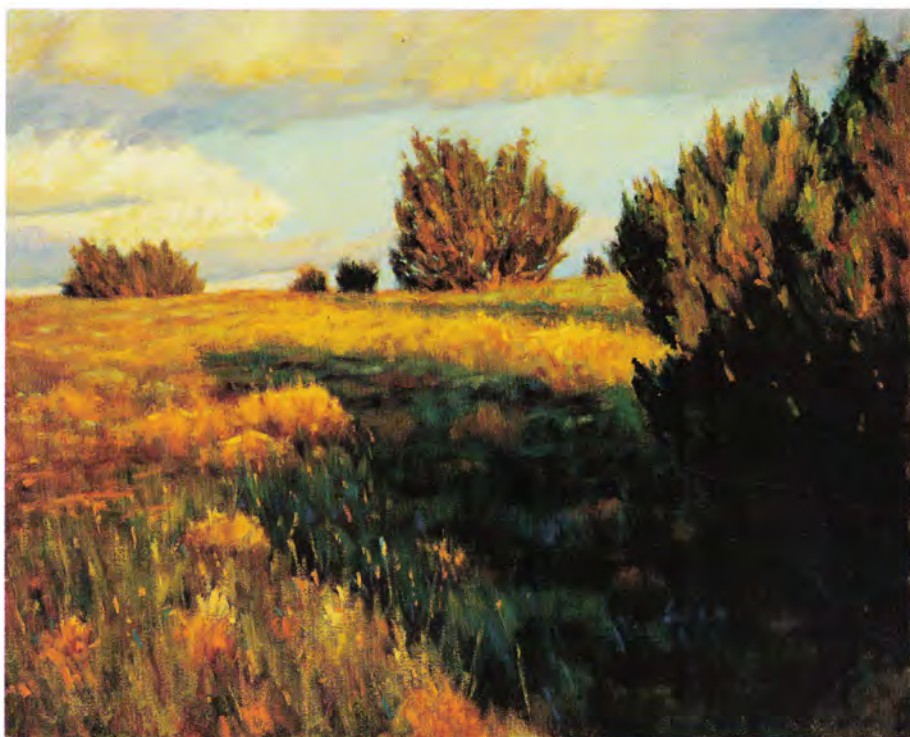
ABOVE: JUNIPER SHADOWS, OIL, 24 X 30.