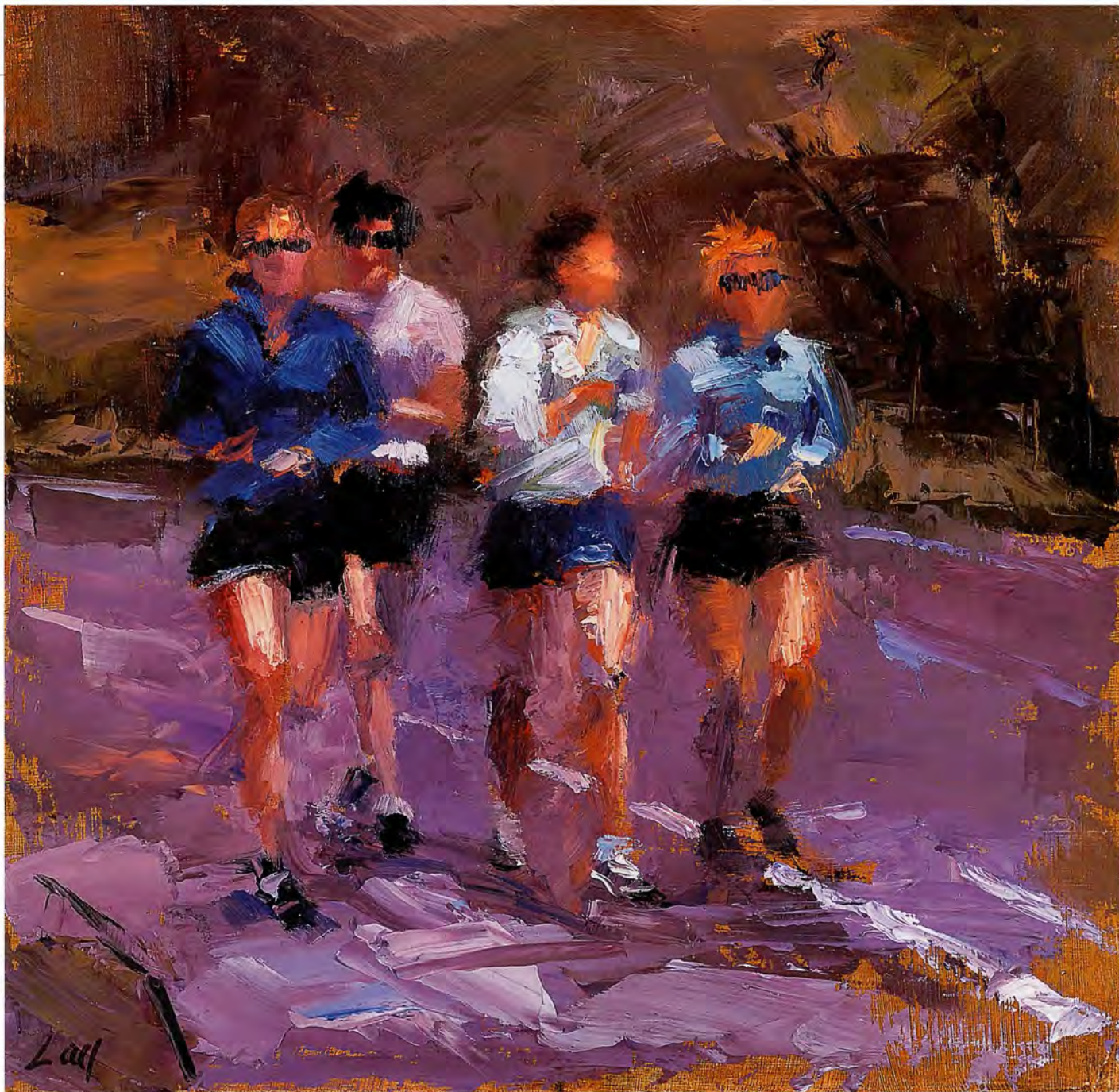
◀ HOME COOKING, OIL, 9 X 7. MOVERS & SHAKERS, CENTRAL PARK, OIL, 12 X 12. ▲

they await their turn. "I'm interested in the gestures and movements of people interacting with each other," Weyenberg explains.