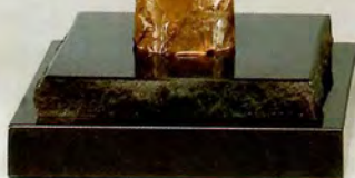
Flea Flicker , bronze, 16 x 14" GOLD MEDAL AWARD WINNER NATIONAL SCULPTURE SOCIETY 2007