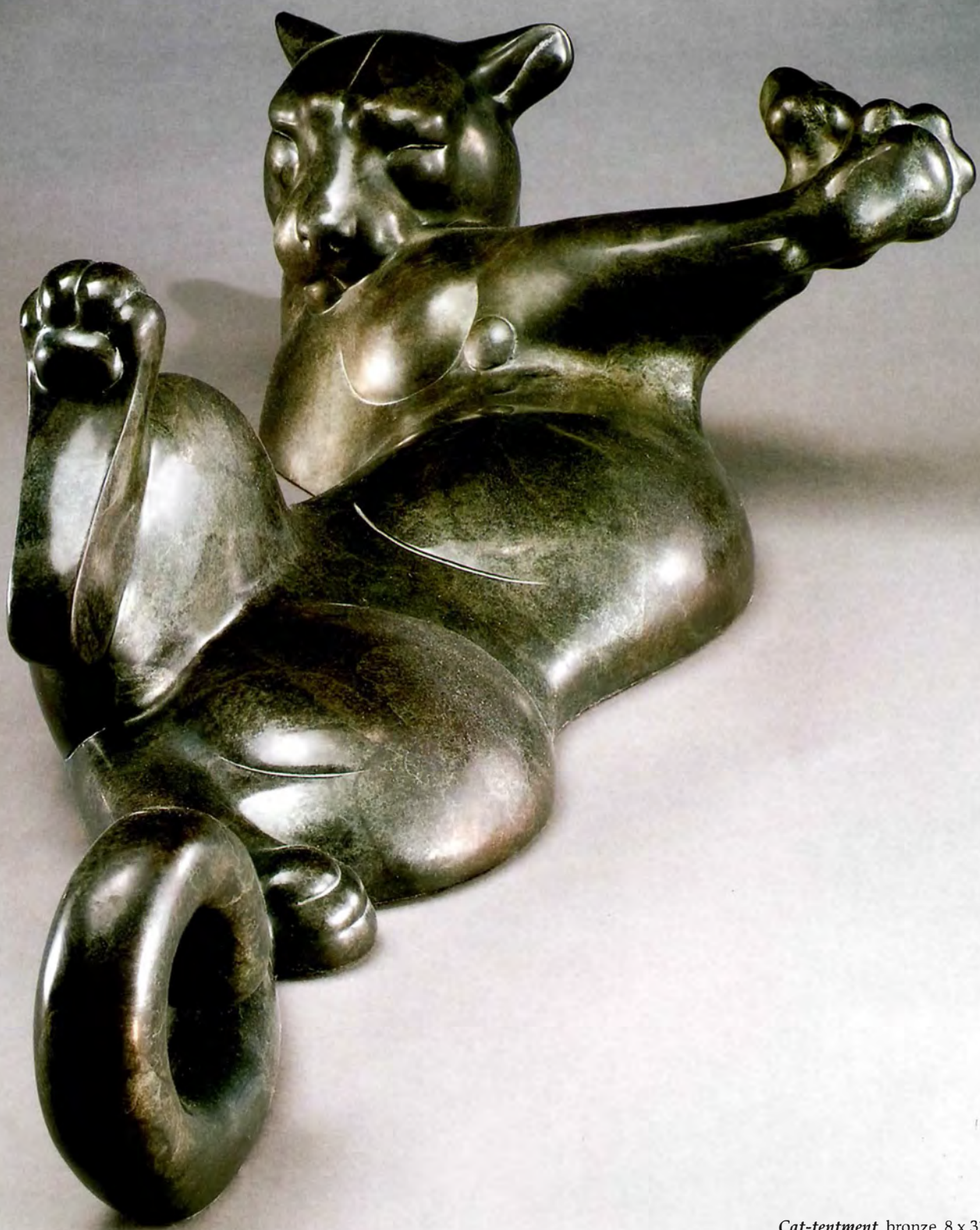
Cat-tentment , bronze, 8 x 31"