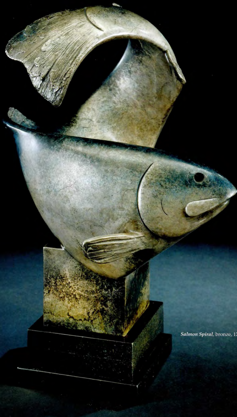
Salmon Spiral , bronze, 17 x 12"