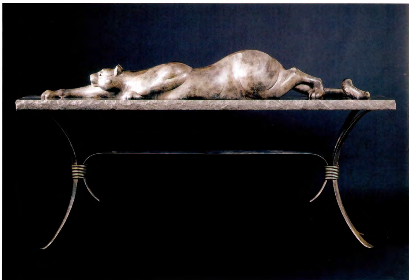
Snake in the Grass , bronze, 40 x 78 x 12," ed. of 18

WINNER OF THE 2001 PRIX DE WEST JAMES EARLE FRASER SCULPTURE AWARD