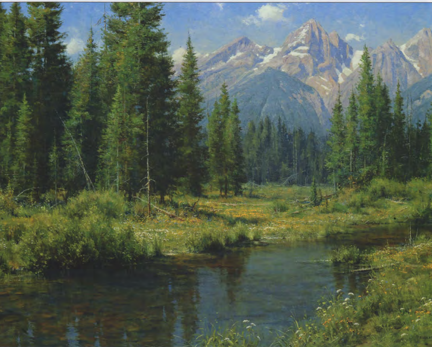
Sweet Day of Summer, oil, 30" by 40"

"Summer in the Teton Range is truly a special time. The idyllic summer days are literally buzzing with life."