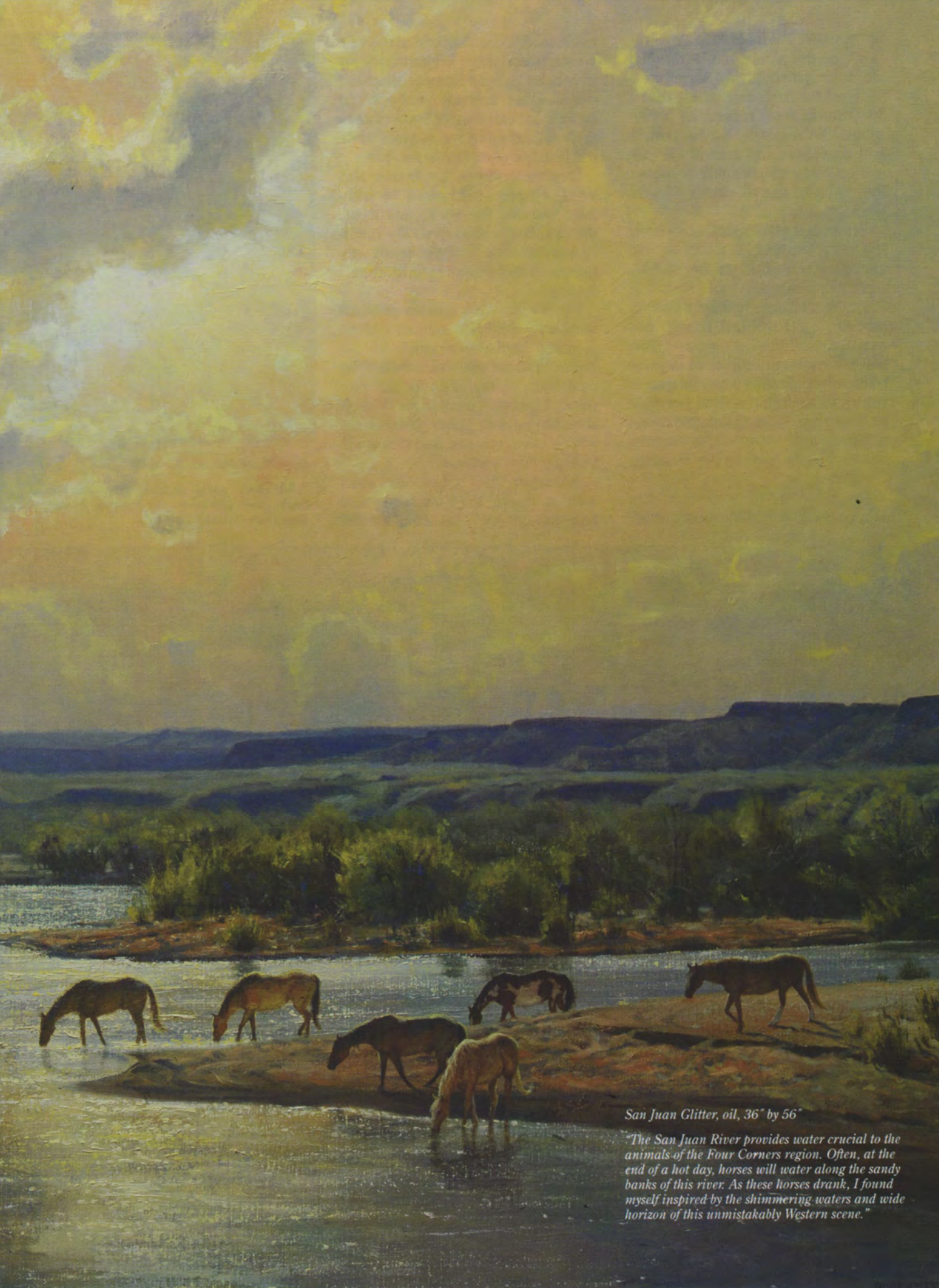
San Juan Glitter, oil, 36" by 56"

"The San Juan River provides water crucial to the animals of the Four Corners region. Often, at the end of a hot day, horses will water along the sandy banks of this river. As these horses drank, I found myself inspired by the shimmering waters and wide horizon of this unmistakably Western scene."