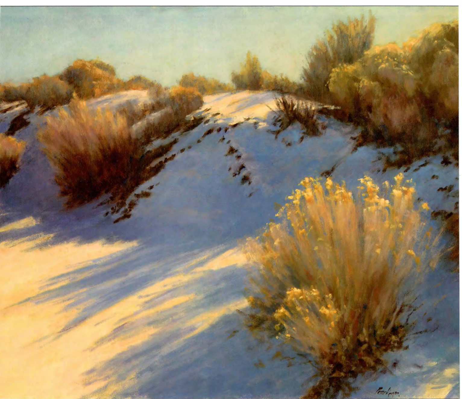
Winter Blues, oil, 24" by 30"

"This is a late winter afternoon in one of the many arroyos in the Santa Fe area. I was taken with the blue shadows, mixed with the golden softness of the chamisa."