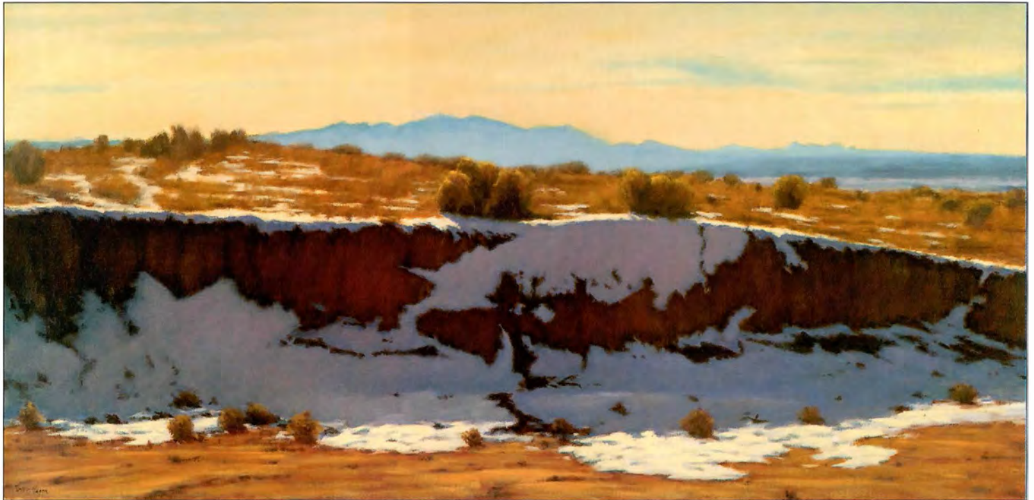
In the Shadows, oil, 24" by 48"

"This is one of the old orchards around Velarde, New Mexico. It was early spring along the Rio Grande. These orchards are small treasures. They were dripping in blossoms. I was lucky to get this one, as a frost moved in that night."