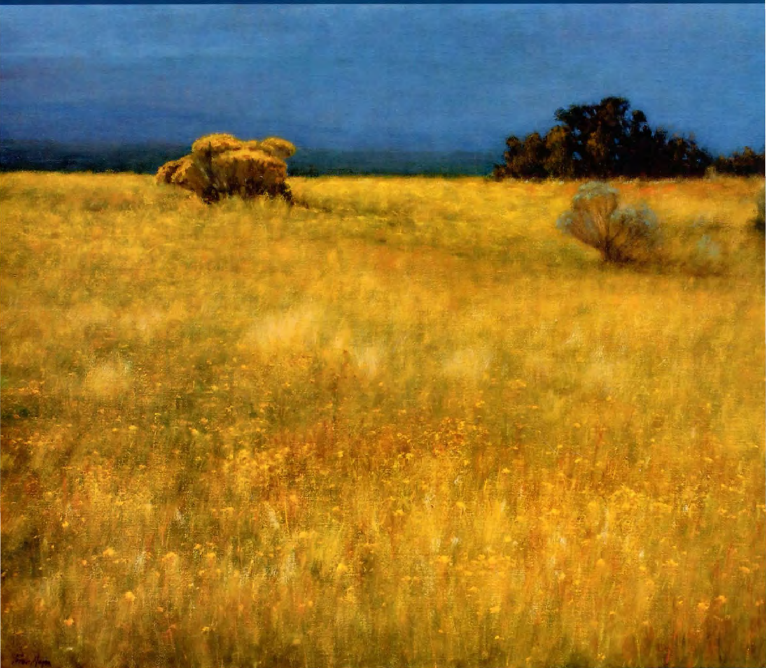
"Come Go With Me" • 34"x 40" • Oil