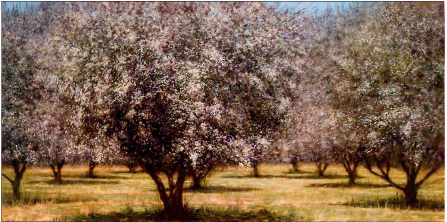
Flores de Manzano, oil, 30" by 60"

"This is one of the old orchards around Velarde, New Mexico. It was early spring along the Rio Grande. These orchards are small treasures. They were dripping in blossoms. I was lucky to get this one, as a frost moved in that night."