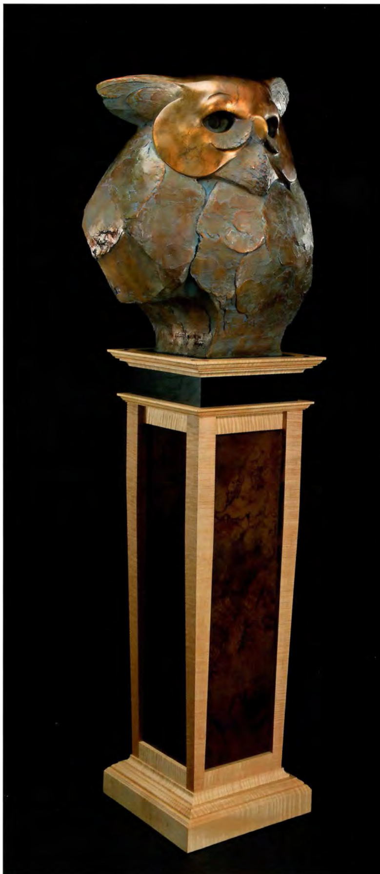
Wise Guy, bronze, 66" high by 17" long