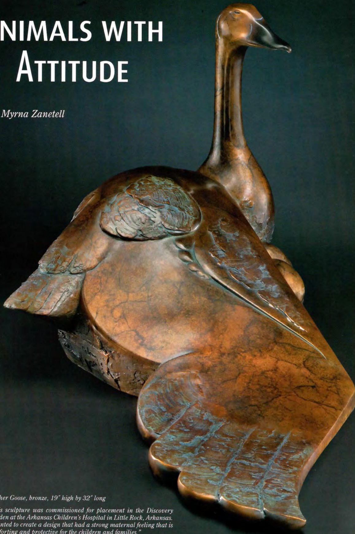
Mother Goose, bronze, 19" high by 32" long

"This sculpture was commissioned for placement in the Discovery Garden at the Arkansas Children's Hospital in Little Rock, Arkansas. I wanted to create a design that had a strong maternal feeling that is comforting and protective for the children and families."