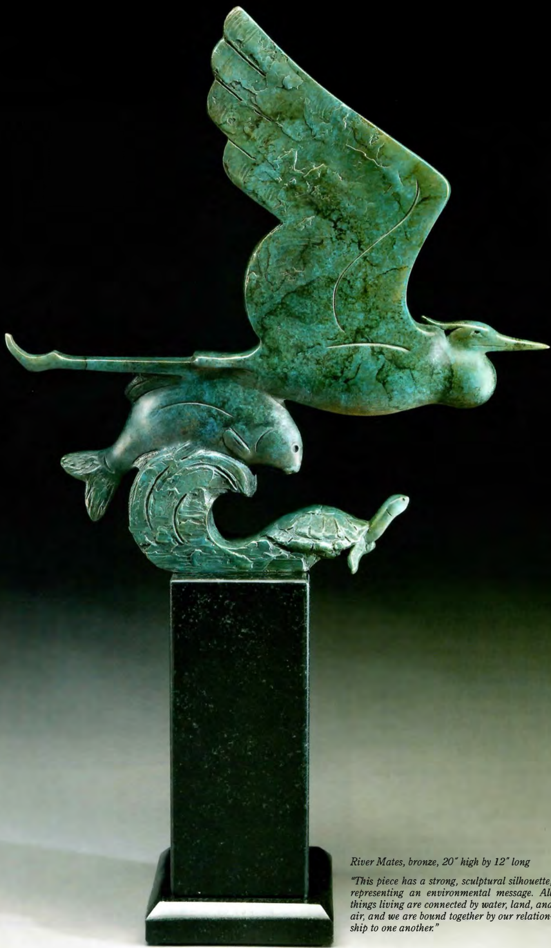
River Mates, bronze, 20" high by 12" long

"This piece has a strong, sculptural silhouette, representing an environmental message. All things living are connected by water, land, and air, and we are bound together by our relationship to one another."